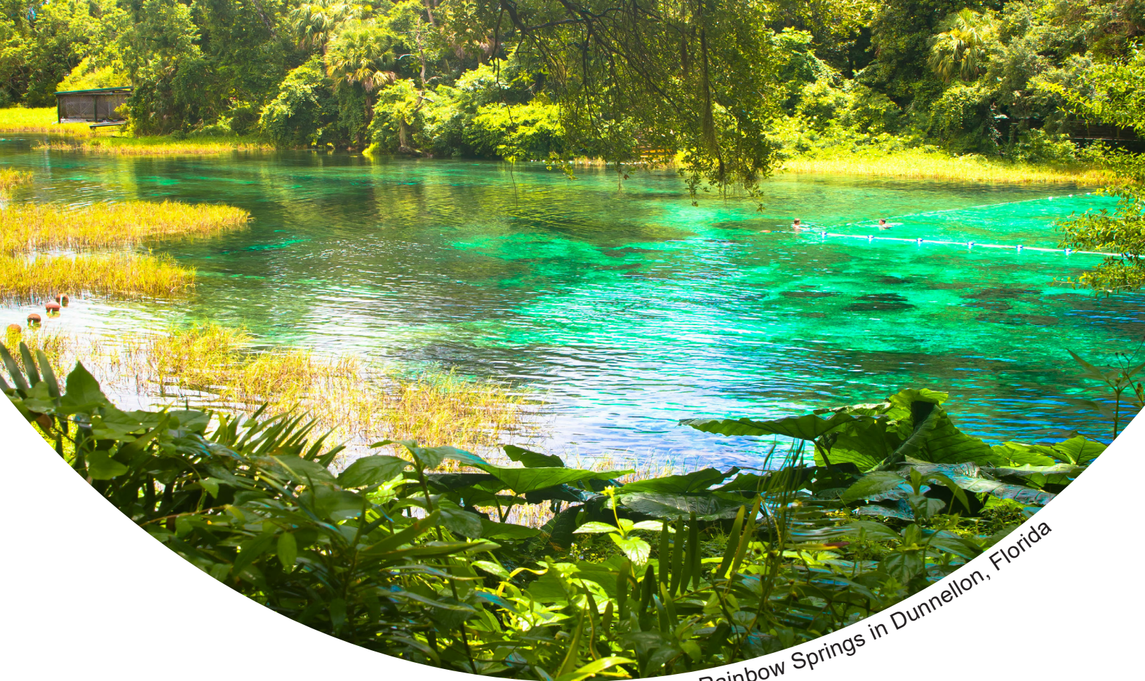
Rainbow Springs in Dunnellon, Florida