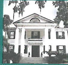
Knott House Museum