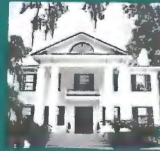
Knott House Museum