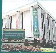
Museum of Florida History

Friends of the Museums of Florida History, Inc.