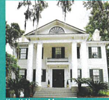
Knott House Museum

Your Museum. Your Florida. Your History.