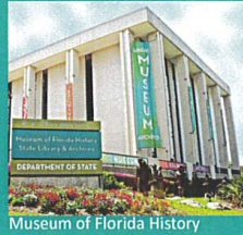
Museum of Florida History

Friends of the Museums of Florida History, Inc.