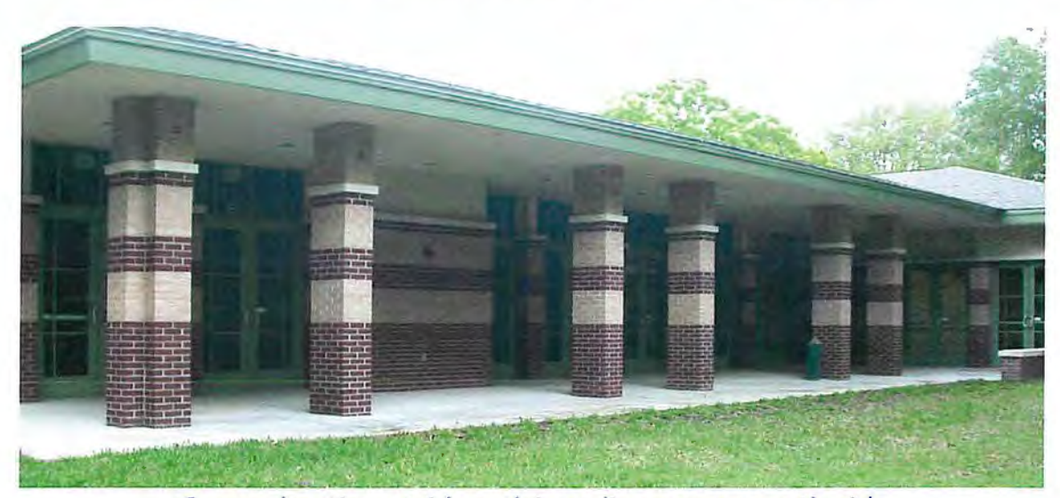
Covered patio outside multi-media room on north side