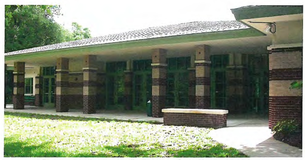
Recreation Center south elevation from the tennis courts