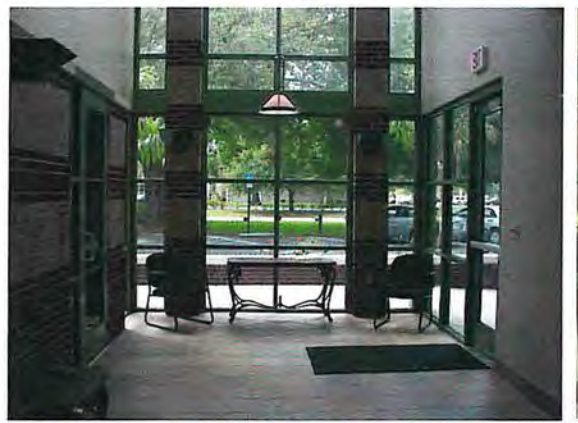
Entrance to lobby from McFarland Road