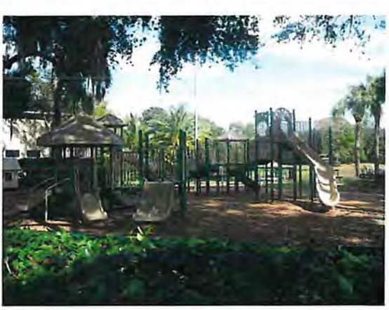
Renovated pavilion and Playground—October, 2008

History: Built in 1964, the original site of Carrollwood beach