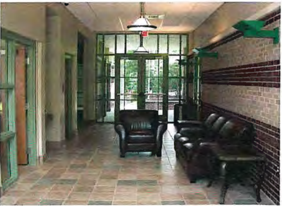
Entrance to lobby from tennis courts