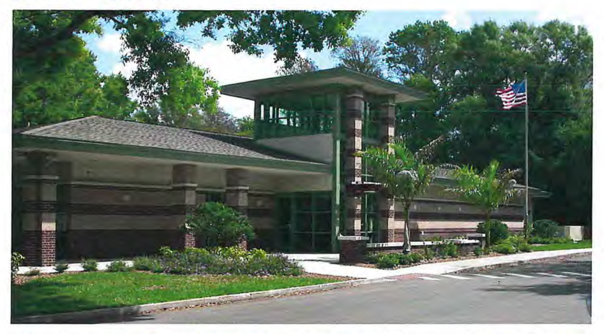
New Recreation Center (South Elevation)—officially opened June 16, 2007