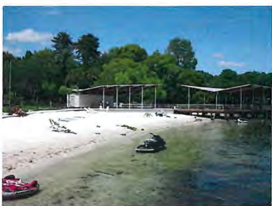
New pavilion, docks, and landscaping-May 2007 & April 2008